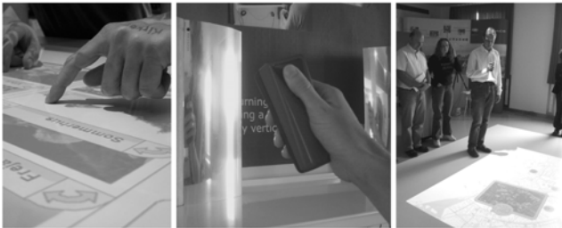
Figure 3 From left to right: close-up of table. Emote, and mediafloor.

MediaSurfaces is a concept allowing people to distribute their digital materials on a range of connected interactive surfaces in the home [7]. These surfaces range from being table projection, wall displays as well as projections on floors. Floor projections are oriented in one direction, e.g. such that the materials are displayed at the entrance and viewed as people come home.