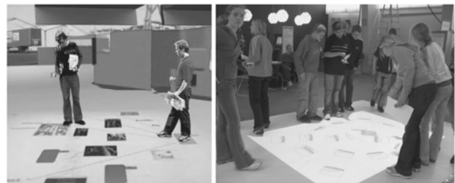
Figure 2 Playful interaction on the left, and iFloor on the right

Playful interaction (See Figure 2, left) is a vision prototype developed as part of the Workspace project [1]. The motive behind the vision was to explore how more playful relations to materials can be established in a work environment. Among other ideas, this video depicts a vision where digital materials can be placed on- and picked up from a floor through bouncing a ball on the floor. Thus the ball is used as a means for placing and picking up documents on physical surfaces like floors and walls. Documents are organised in dynamic tree structures, oriented primarily one way. People stand on the surface when interacting with it.