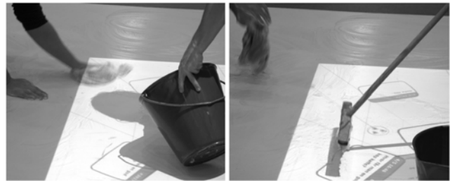
Figure 4 The iFloor – mud and technology go together

The urban perspective on interactive floors also involves regarding technology as an integral part of the public environment implying that it should cope with filth and rough use as any other public design. In the case of the iFloor this is done by using technologies that slip into ceilings leaving only tracked projected footprint on the floor - street or plaza. Such setup introduces the notion of dirty computing where the interface is not treated as something precious and fragile but rather blurs into the environment through muddy footprints and spots from soft-ice, and is thus adapted into the fabric of everyday life (See Figure 4).